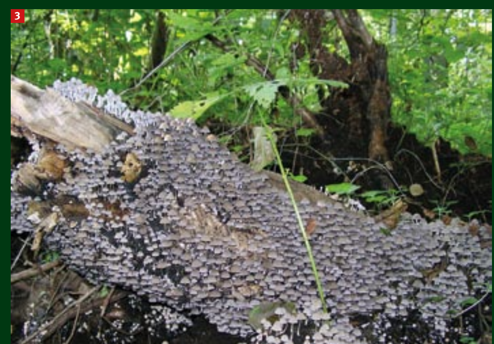
1 2, 3